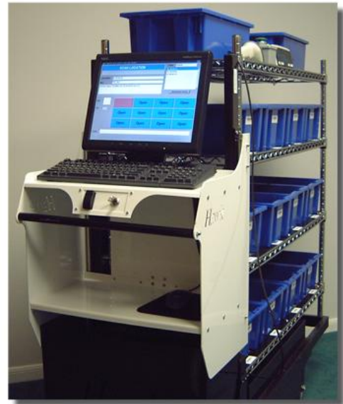
Hawk™ Work Station Cart