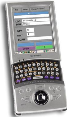
SOFT™ FINCH™ on a SHARP ZAURUS SL-5600