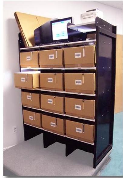
Condor™ Work Station Module